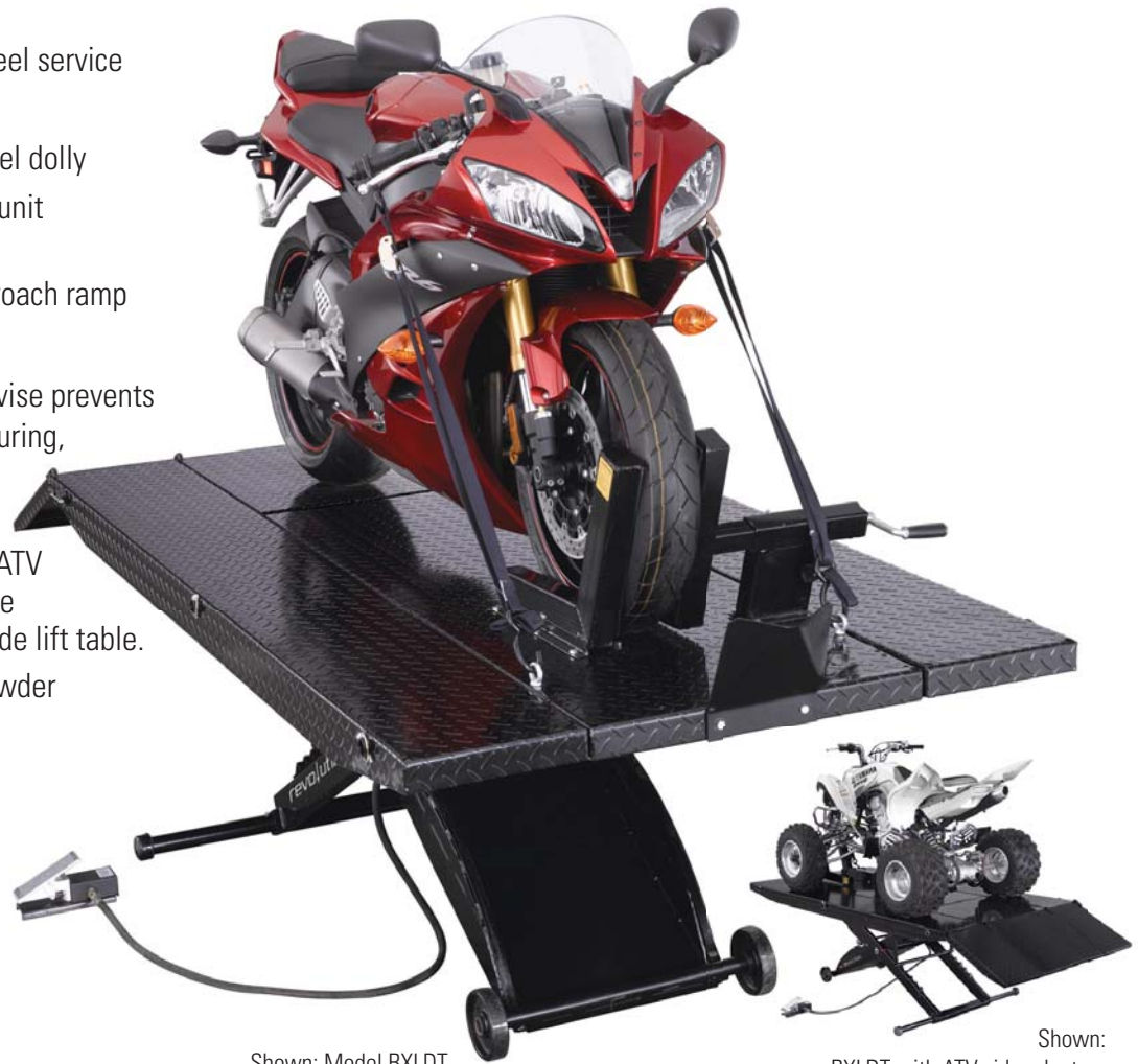
Shown: Model RXLDT 1,000 lbs. (453kg) capacity (Tie down straps not included)