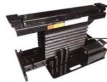
7,000 LB. Rolling Jacks (Air / hydraulic operation)