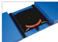
Two (2) front turnplates

Lift includes front turnplates, rear slip plates, two rolling bridge jacks and internal air lines.