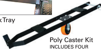
Poly Caster Kit INCLUDES FOUR (4) CASTERS