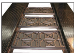
Three (3) Drip Trays